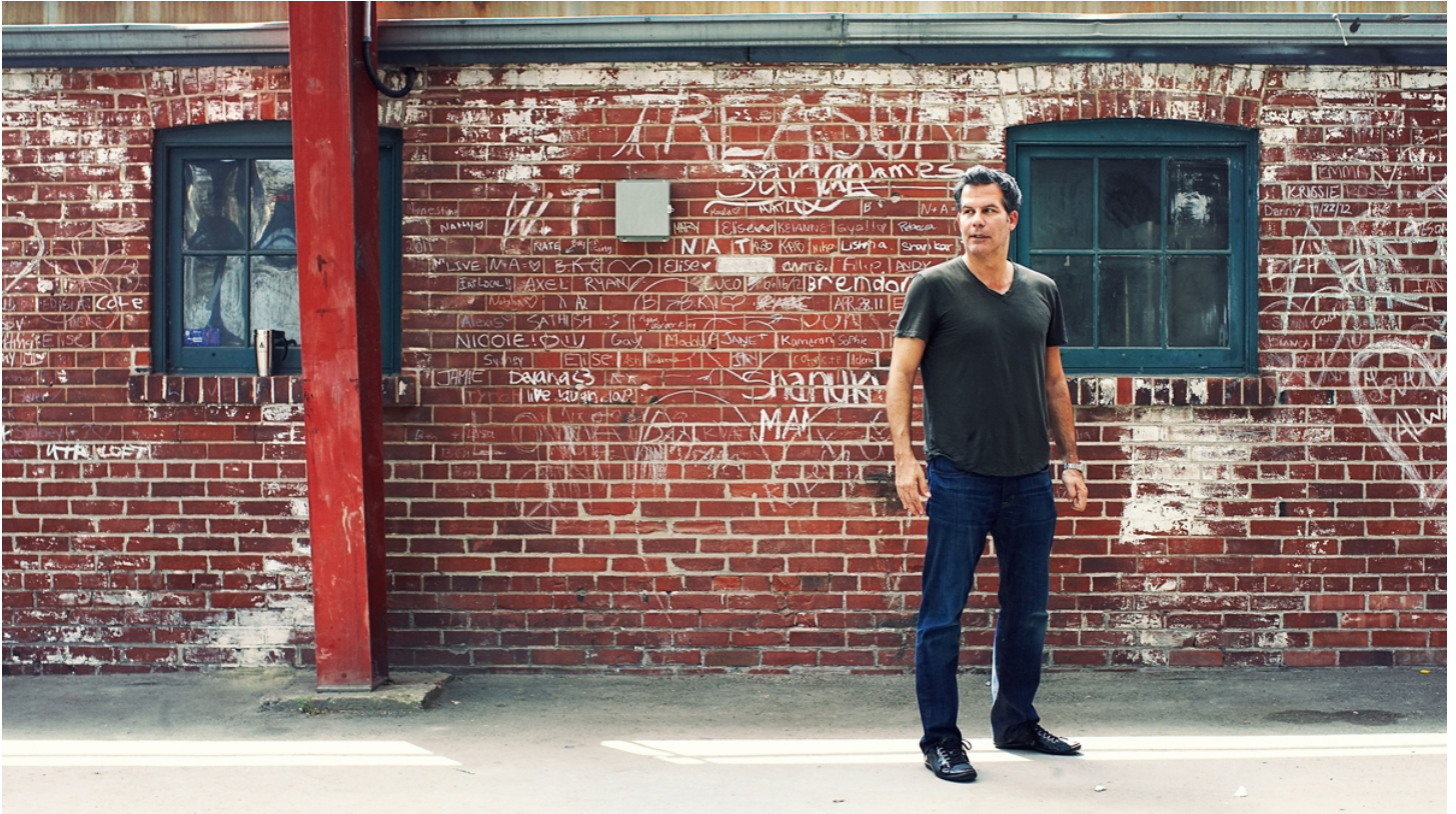
Richard Florida envisions designing smarter, stronger cities that offer more opportunities for all.