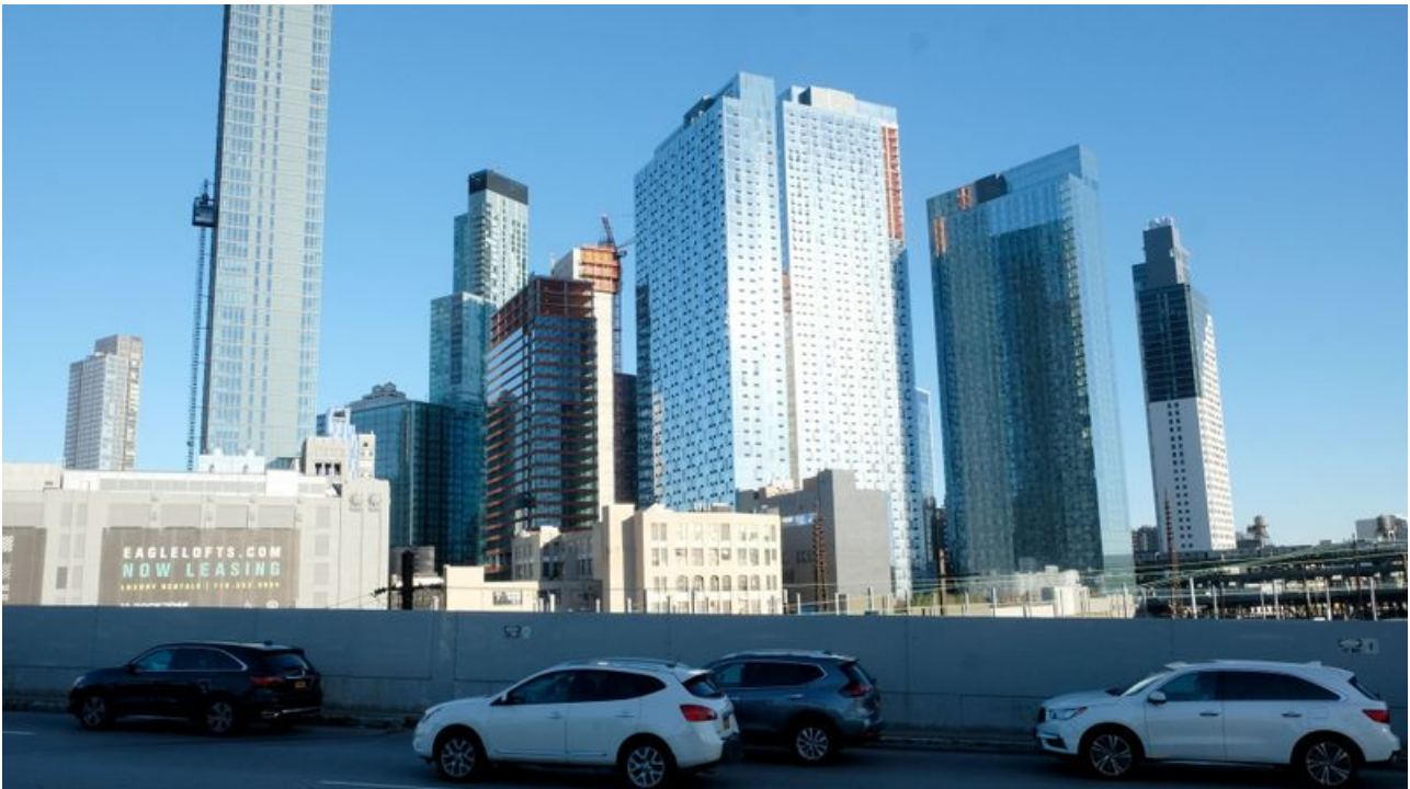
Cushion the Amazon impact on Long Island City.