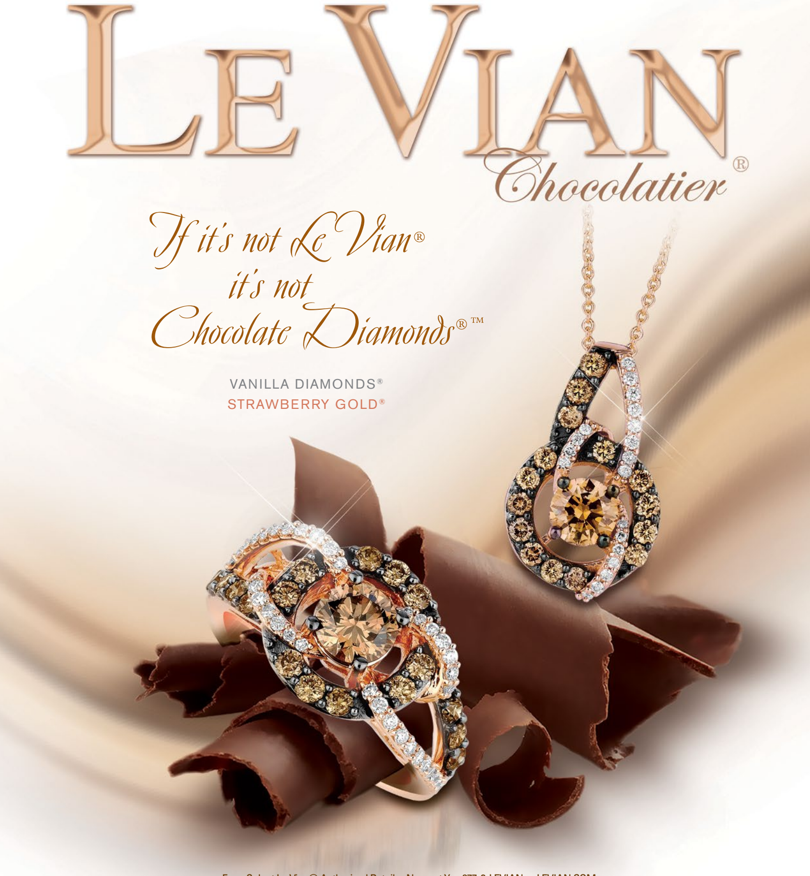
For a Select Le Vian® Authorized Retailer Nearest You 877-2-LEVIAN or LEVIAN.COM