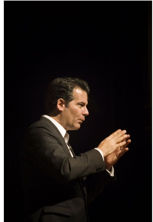
Richard Florida.

Richard Florida: One thing I’ve explored more in this revision is how deeply divided our society is by class . Two chapters in the new book delve into our class divide. Class, more than