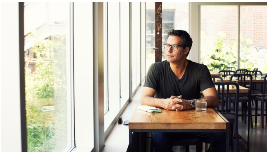
Richard Florida is a world renowned urban theorist know for his book "The Rise of the Creative Class"