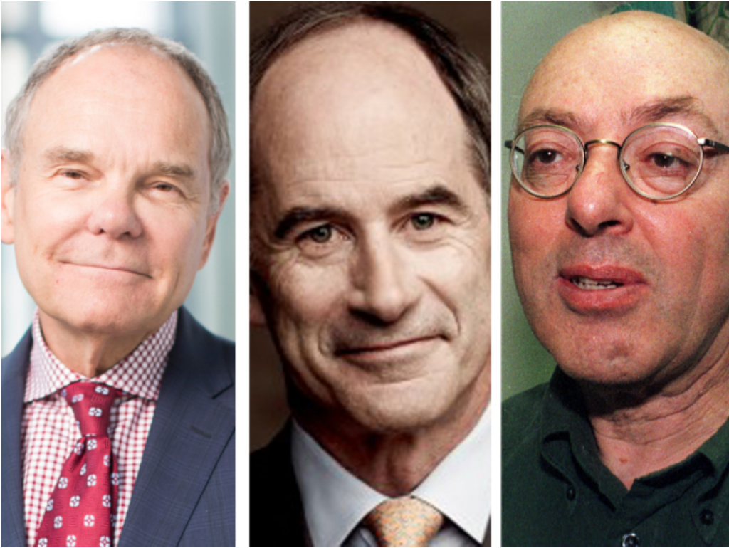
Canadians Don Tapscott, Roger Martin and Henry Mintzberg were honoured by Thinkers50.

Financial Post Staff | November 11, 2015 4:29 PM ET