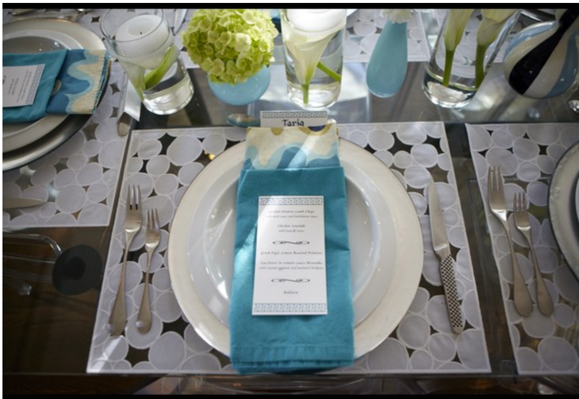
Greek Party Table Setting

Topics: Outdoor , Entertaining , Dining , Summer , Party , Blue , White , Backyard , Inspiration